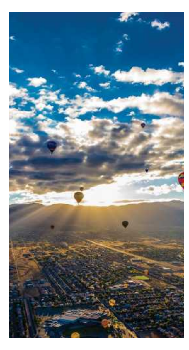
Making Christlike Disciples in All the Nations